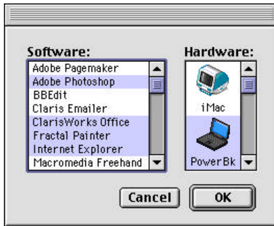
FIG 1 - DIALOG BOX WITH TWO LISTS

To create a list with graphical elements, such as the list at the right at Fig 1, you must write a custom list definition function (see below), because the default list definition function only supports the display of text.